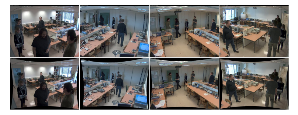
Figure 2: The views from all four cameras. Original images are shown in top row. We use images with lens distortion calibrated and corrected, as shown in the bottom row.

manually synchronized them with the help of timestamps printed on top of the frames. Afterwards, we extracted 7840 video frames from time-aligned videos, again using ffmpeg.