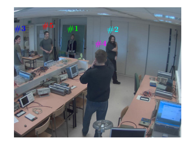
Figure 3: Participating individuals.